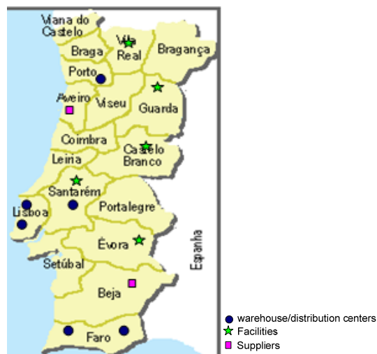
Figure 1- Supplier, facilities and warehouse/distribution centres potential locations.

In terms of environment, it is assumed that at each facility, some electricity consumption will occur and an associated environmental impact will exist. Also environmental impacts related to transportation namely in terms of CO 2 , NO x and SO x emissions will be considered. The corresponding values per unit are given in Table 3.