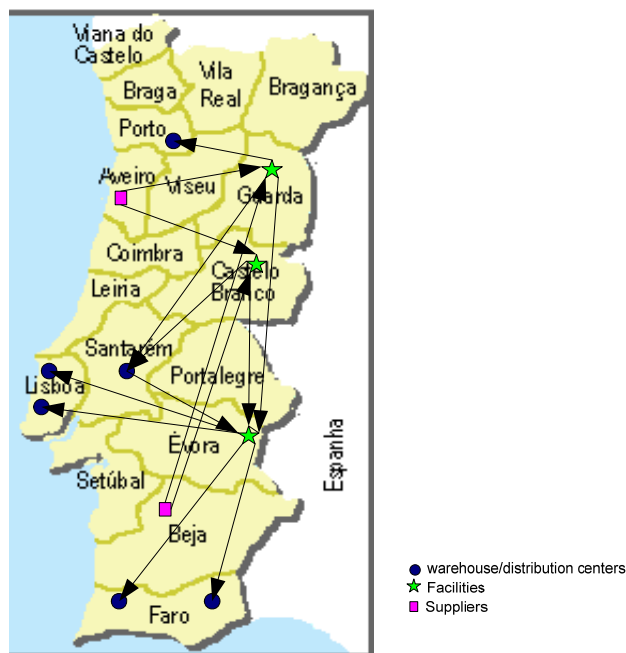
Figure 2- Final supply chain network.

The obtained results are shown in Figure 2. It is possible to visualize that facilities were opened in three locations (Guarda, Castelo Branco and Évora). In Guarda the T5 and T2 technologies were selected to produce S7, S3 and S4. The Castelo Branco facility only utilizes T1 technology for producing S4 and S3 and finally Évora installed technologies T3 and T4 and produces the S5 and S6 products (Table 5).