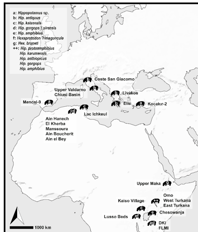
Figure 1. Geographic map that includes the sets of fossil sites with the presence of hippos with a chronology between 2.6 and 1.6 million years from central Africa to southern Europe. DKI: Douglas Korongo I; FLMI: Frida Leakey Korongo West I.

Roussillion (Moldova; Vangengeim et al. , 1998), although the validity of the determinations and the stratigraphic position of the materials have been discussed (O'Regan, 2008). Subsequently, there are references to hippo specimens in sites around the Upper Valdarno area (Italy, ca. 2.0-1.8 Ma; Gliozzi et al. , 1997), Mencil-9 (Spain, ca. 1.7 Ma; Pla-Pueyo et al. , 2011; Arribas, Pers. Comm.) and Livakos (Greece, ca. 1.6 Ma; Koufos, 2001). Following Mazza (1991), all hippo presences in the Early Pleistocene in Europe would be determined as H. antiquus . Made et al. (2017) propose to differentiate between H. antiquus for those sites with chronologies older than 1.7 Ma and H. tiberinus for those with chronologies after 1.4 Ma, recovering the disputed taxon H. tiberinus described by Mazza (1991) on the basis of Middle Pleistocene remains from the Italian peninsula (Fig. 1).