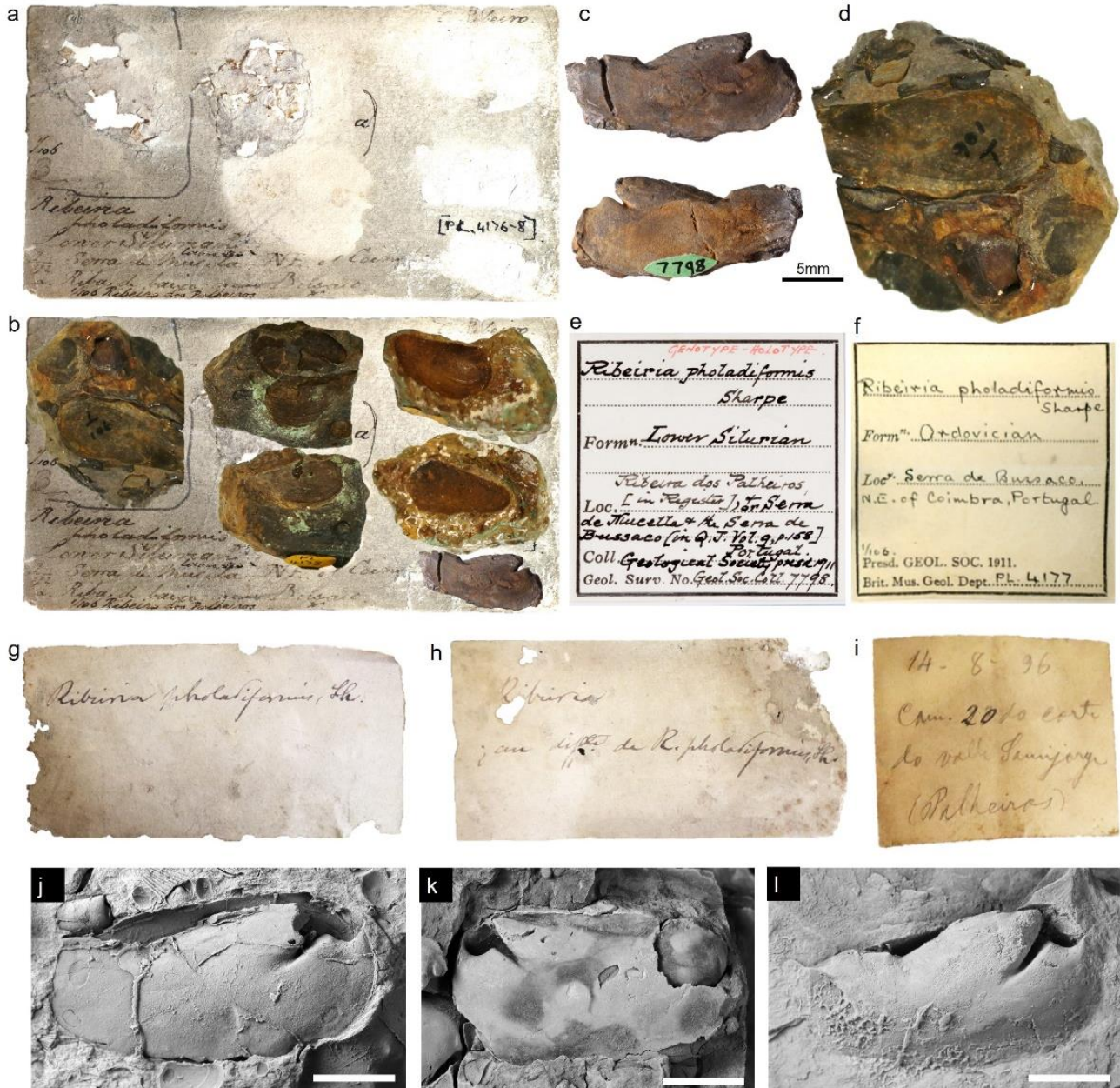
Figure 2. Original labels and type-material of the Ribeiria pholadiformis (a–f) and details of the Geological Museum of Portugal fossil collection (g–l). (a) Daniel Sharpe's original label of the R. pholadiformis type-material. (b) Reconstruction of the fossils' position in the original label. (c), (e) Internal mould of the lectotype of R. pholadiformis and its label (NHM PL. 4177, right-lateral and left-lateral views). (d), (f) External mould of the lectotype of R. pholadiformis and its label (BGS 7798, left valve in lateral view). (g)–(i) Original labels of R. pholadiformis from the Geological Museum of Portugal (GM) collection. (j)–(l) Some R. pholadiformis specimens of the GM collection, from the Vale de S. Jorge section (k, l) and Portela de Oliveira (j) [internal moulds, in right-lateral view (j, l) and left-lateral view (k)]. Scale=5mm.

Figura 2. Etiquetas originais e material-tipo de Ribeiria pholadiformis (a–f) e detalhes da coleção do Museu Geológico de Portugal (g–l). (a) Etiqueta original de Daniel Sharpe do material-tipo de R. pholadiformis . (b) Reconstrução da posição dos fósseis na etiqueta original. (c), (e) Molde interno do lectótipo de R. pholadiformis e etiqueta atual (NHM PL. 4177, vista lateral direita e vista lateral esquerda). (d), (f) Molde externo do lectótipo de R. pholadiformis e etiqueta atual (BGS 7798, valva esquerda em vista lateral). (g)–(i) Etiquetas originais de R. pholadiformis da coleção do Museu Geológico de Portugal (MG). (j)–(l) Alguns exemplares de R. pholadiformis da coleção do MG, do corte do Vale de S. Jorge (k, l) e Portela de Oliveira (j) [moldes internos, em vista lateral direita (j, l) e vista lateral esquerda (k)]. Escala=5mm.