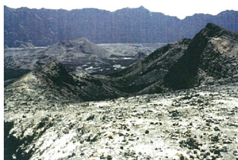
Fig. 1 – Principal vents of 2014-15 eruption on Fogo Island and incrustations field.

Two sampling campaigns were performed near the 2014-15 vents (Fig. 1), in November 2016 and in February 2017 and rocks (basaltic lava) plus incrustations were collected.