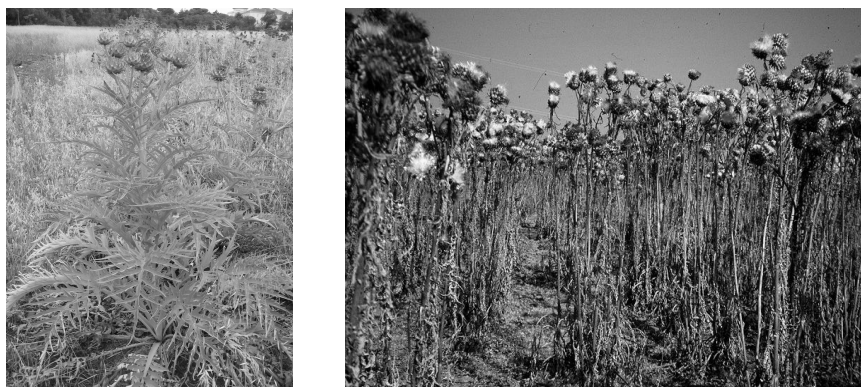
FIGURE 1 Cynara cardunculus L. or cardoon aspect during vegetative cycle (left) and at the end of the cycle (right)